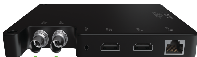
3G-SDI OUT 3G-SDI IN EXT. TALLY HDMI OUT HDMI IN ETHERNET PoE